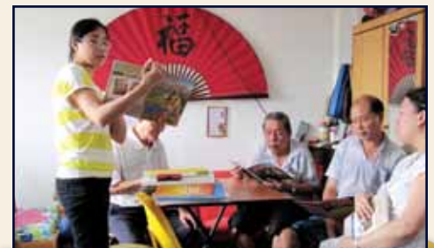
Teaching the people living in the home for the elderly about God's big story of redemption by using The Story of Hope .

We receive stories like this from all over the world. We train people in evangelism and discipleship. They train others. People learn to share the gospel clearly with those around them. God draws those people to Himself and they trust in Christ as their Savior. Eternity is impacted. Please consider joining us for one of our upcoming seminars or using one of our resources to share God's love clearly with someone who is waiting to hear. Even though we may not know their names, God does, and He wants to use you to bring them to Himself.