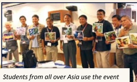
Students from all over Asia use the event images for a review activity.