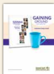
Individual Study Guide