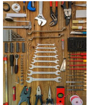
Mobilize Servants 2