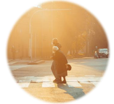
Mentalize Saints 6