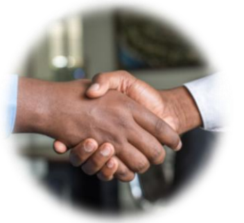
Mentelize Saints 1

Treat disciples as vital, important to the work, equals