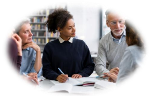
Mentelize Saints 4