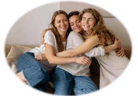
Mentelize Saints 2

Pray for Trainees; Let Them Know of Your Prayers