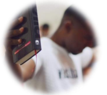
Mentelize Saints 3

Pray for Trainees; Let Them Know of Your Prayers