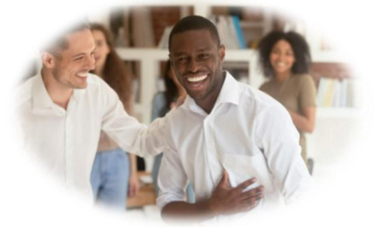
Mentalize Saints 5